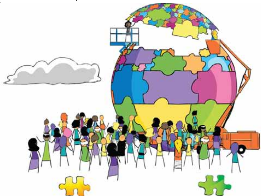
ENGLISH LANGUAGE ARTS