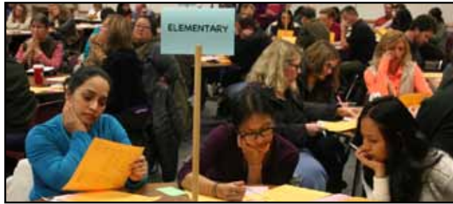
Parents learn about the new assessments at a recent Common Core information night.

In addition to a year-end test, teachers will be able to administer