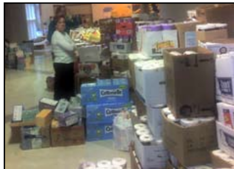
Volunteers box up the generous donations to the Holiday Baskets drive during the event last year. Distribution and boxing of donations will be held Dec. 18 at Kellogg Middle School.

For information on how you can help a family or support the Holiday Baskets drive, visit www.shorelinepta.com and click on "Holiday Baskets."