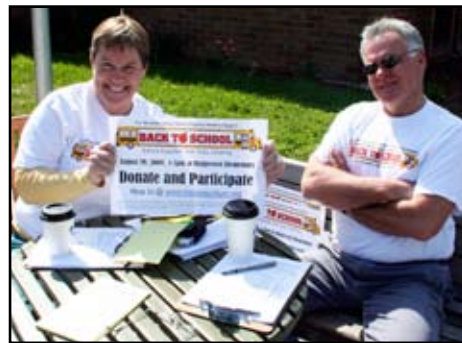
Back to School Consortium members collected backpacks and school supplies at the Embrace Shoreline Schools event.