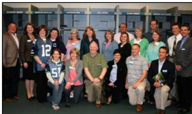
Shoreline's 2010-11 Symetra Financial Heroes in the Classroom were honored at a luncheon hosted by the Seahawks at Qwest Field that included a tour of the locker room, with a locker set aside for each winning teacher.

Hero selection is based on a teacher's ability to balance the core curriculum with students' individual needs; build trust among students, parents and the community; and invest in their students' long-term success. Eleven Shoreline teachers