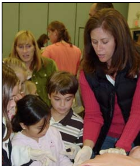
Highland Terrace PTA brought together local experts and organizations for a successful Science Night for that school community.

Meeting monthly, the committee has recently completed a strategic plan to guide its future work. It was presented to the Shoreline School Board at its Jan. 7 meeting.