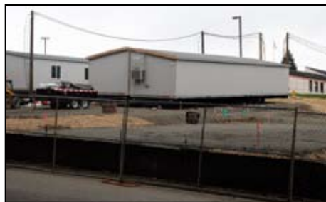
Installation of portable classrooms has begun in the south parking lot at Shorecrest High School.

At Shorewood, work will begin soon to renovate the former wood shop area