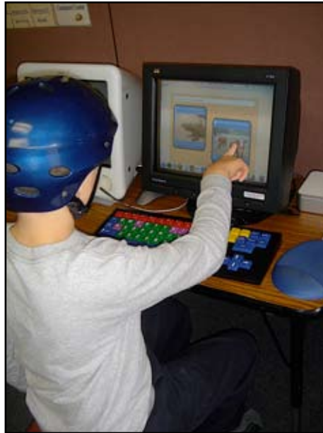
Adaptive technology allows students with physical challenges to use touch screens to access educational programs.

"For our PE classes, it has had an enormous impact," says Brandon