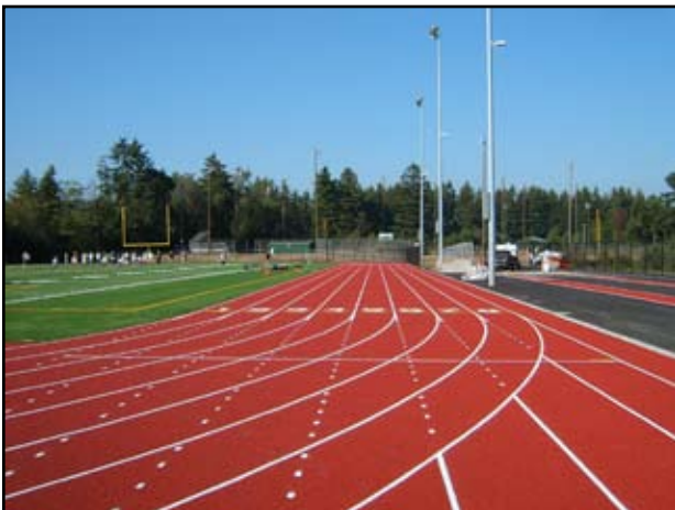
Students and staff at Shorecrest High School are enjoying the new synthetic turf field and track.

For more information on capital projects, visit www.shorelineschools.org , or watch the new capital projects presentation on Channel 26.