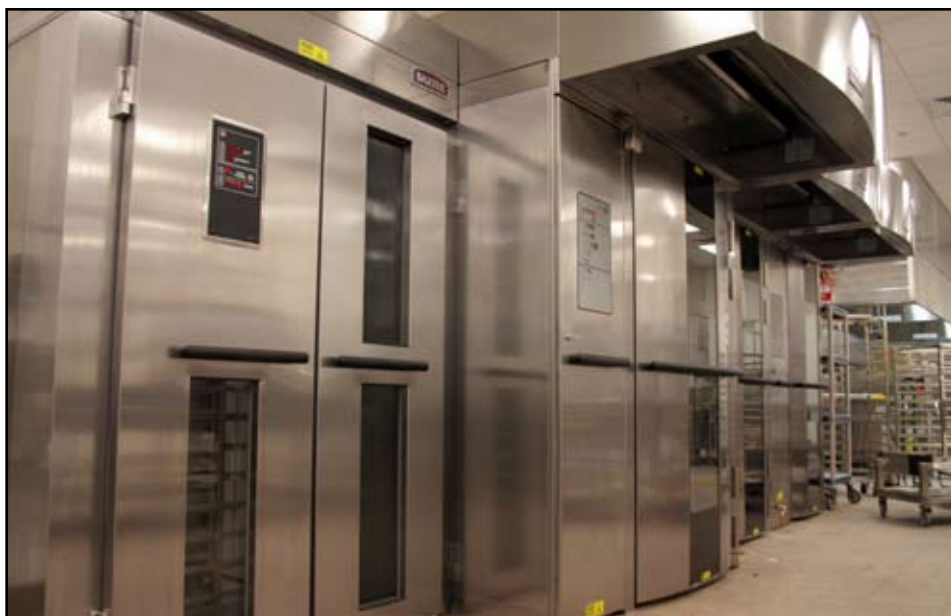
These commercial ovens are an integral component of the new Shoreline Central Kitchen.

Additional plans for the food service program include recommending new menu