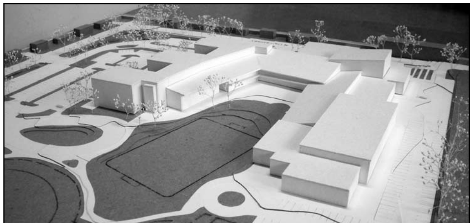
The conceptual design for Shorewood High School, looking north into the new central commons area. The main academic buildings would be three stories, and the campus would include a new performing arts theater and gymnasium.