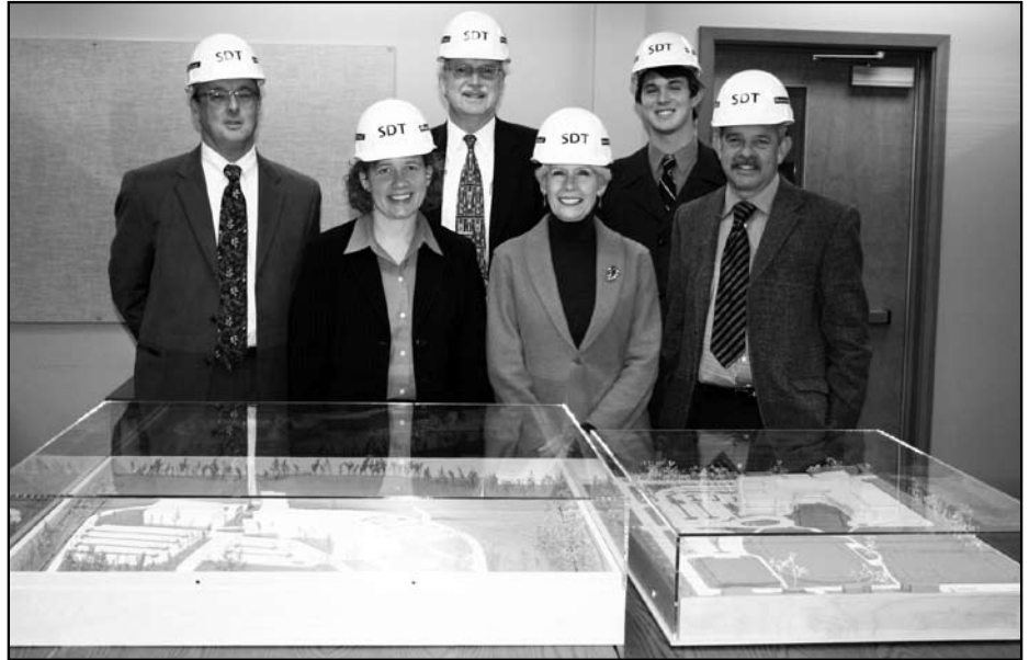
Shoreline School Board members donned hardhats to celebrate the completion of the conceptual designs for Shorecrest and Shorewood High Schools.

of the Town Center concept planned for central Shoreline, where the new City Hall at Northeast 175th and Midvale Avenue North was recently opened.