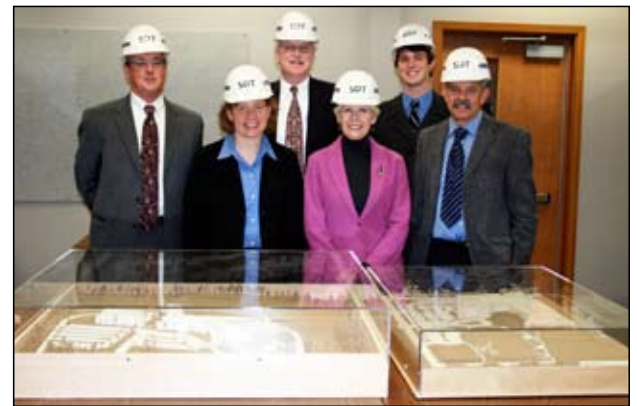
Shoreline School Board members donned hardhats to celebrate the completion of the high school conceptual designs.

The new school would be a cornerstone of the Town Center concept planned for central Shoreline, where the new City Hall at Northeast