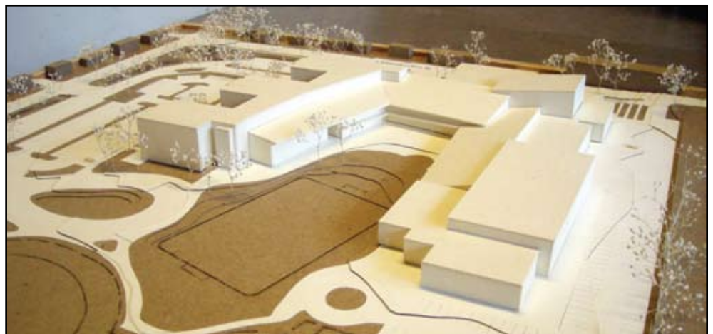
The conceptual design for Shorewood High School, looking north into the central commons area.